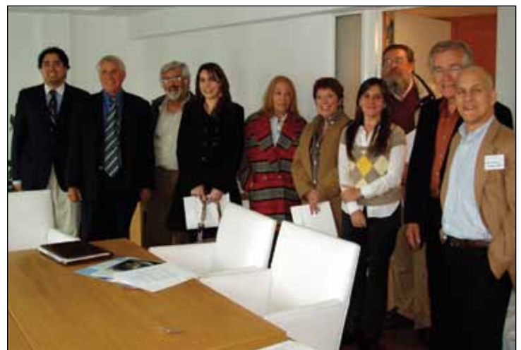
Conference attendees at the Universidad del CEMA in Buenos Aires, Argentina.