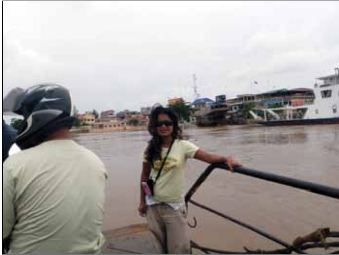
En route to Prey Veng, crossing the river via ferry.