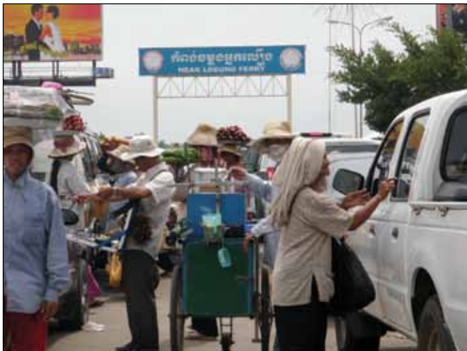
Street vendors approaching vehicles awaiting to board the ferry.