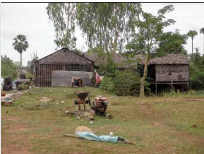
Houses in the Prey Veng countryside.

Before I left for Cambodia, my father gave me a small piece of paper with the address of my aunt's home, my mother's sister. On the back of it, he wrote how much money each person should get, which he sent with me to give.