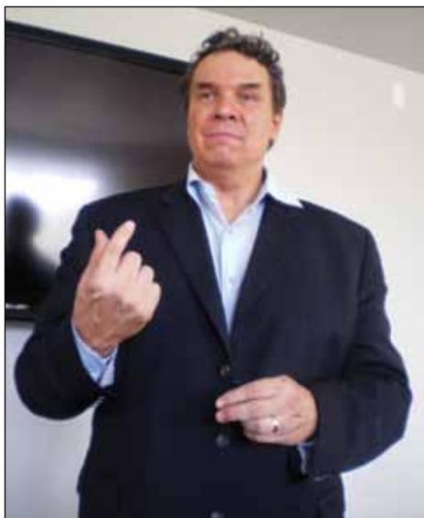
Greg Mortenson